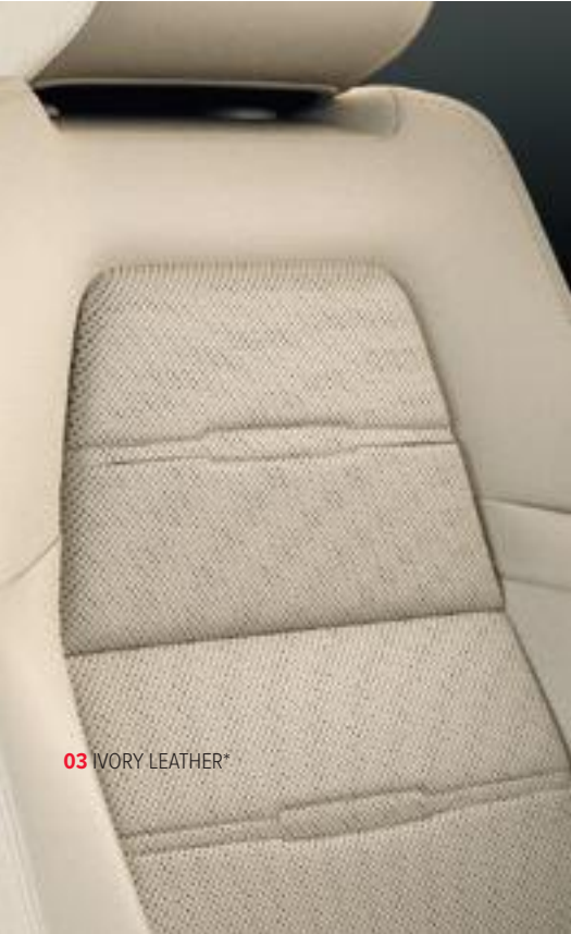
03 IVORY LEATHER*