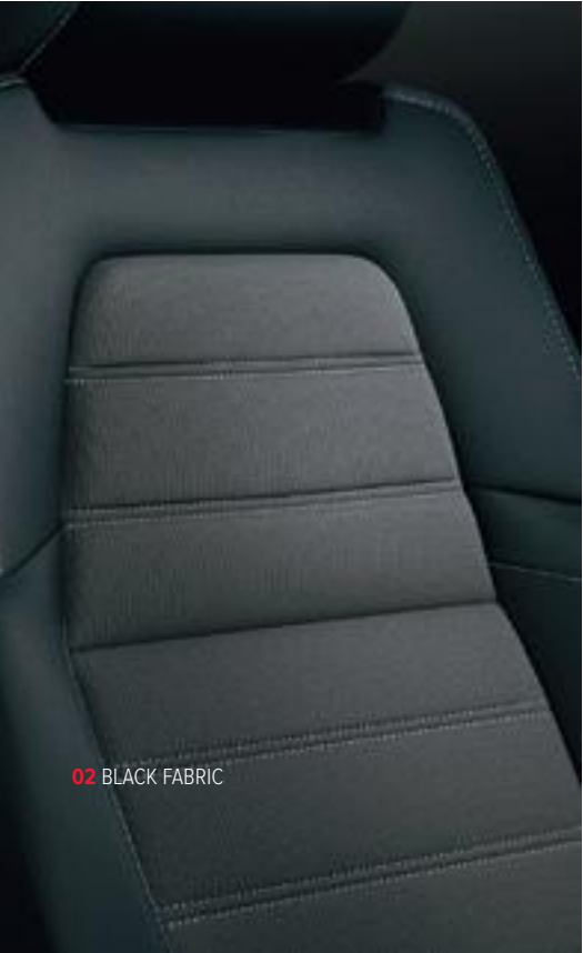
02 BLACK FABRIC