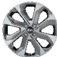
17" Alloy wheels (205/55R17)