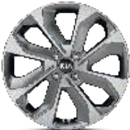
17" Alloy wheels (205/55R17)