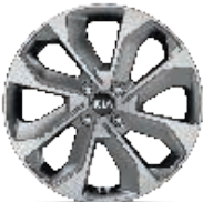
17" Alloy wheels (205/55R17)