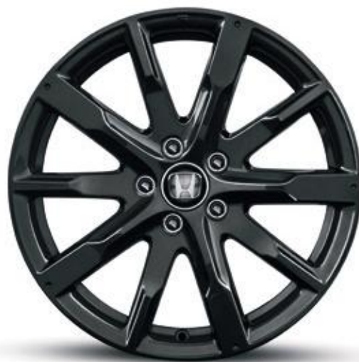
18" CR1802 ALLOY WHEEL

This alloy comes with Gunpowder Black windows and a diamond cut A-surface with shiny clear coat.