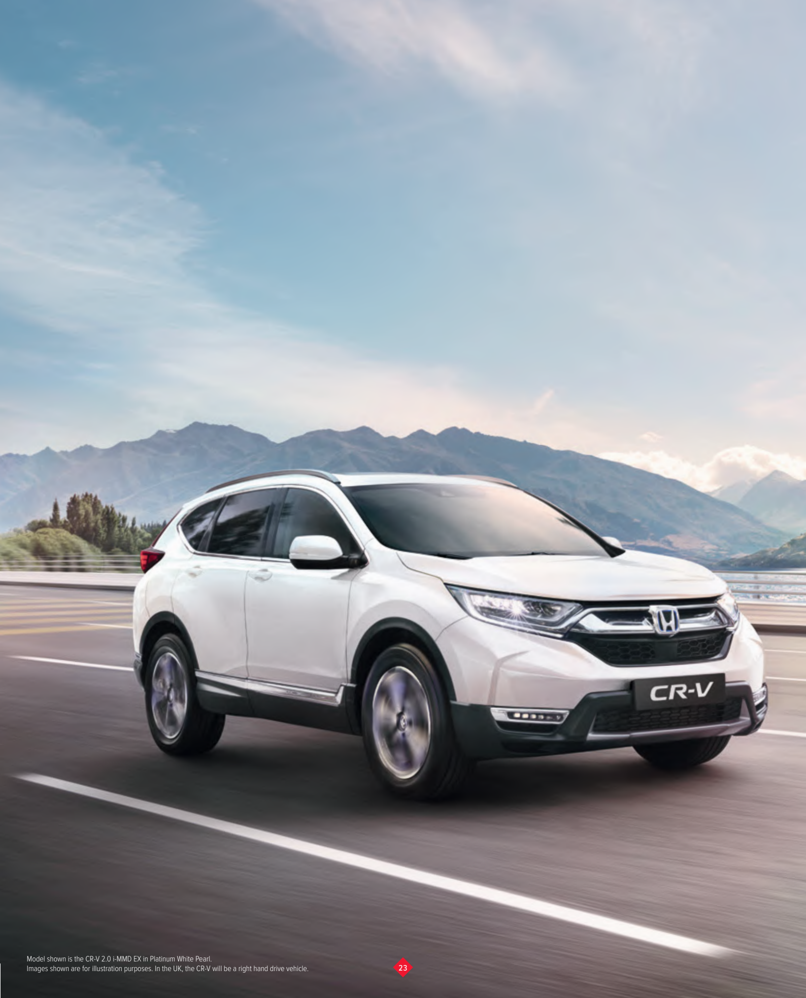
Model shown is the CR-V 2.0 i-MMD EX in Platinum White Pearl. Images shown are for illustration purposes. In the UK, the CR-V will be a right hand drive vehicle.