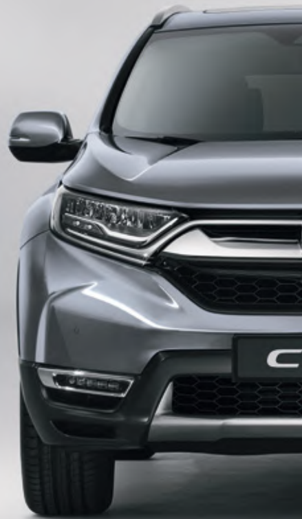
LUNAR SILVER METALLIC