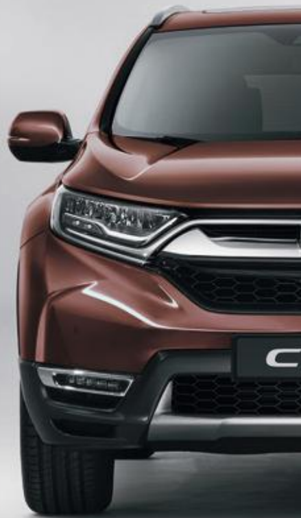
PREMIUM AGATE BROWN PEARL