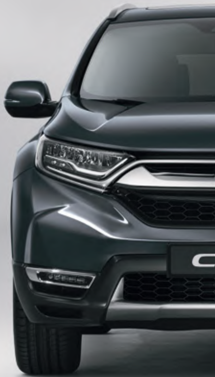
MODERN STEEL METALLIC