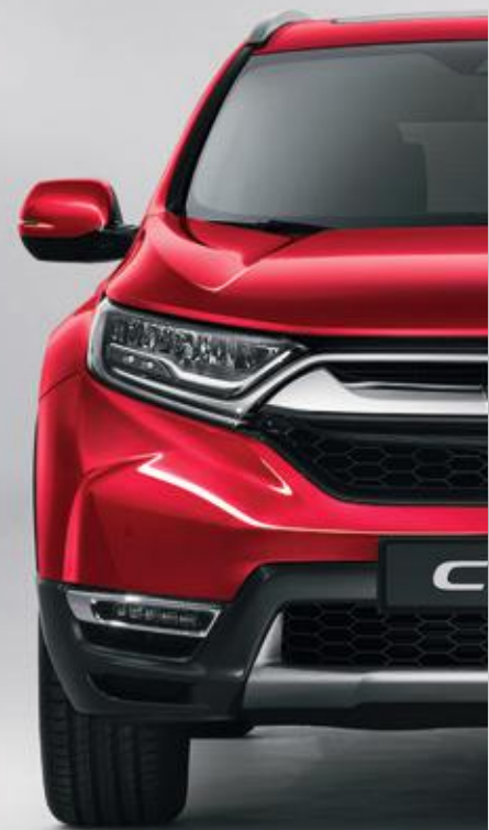
PREMIUM CRYSTAL RED METALLIC*

Images shown are for illustration purposes. In the UK, the CR-V will be a right hand drive vehicle.