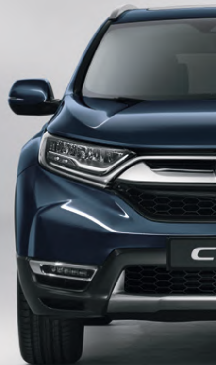
COSMIC BLUE METALLIC