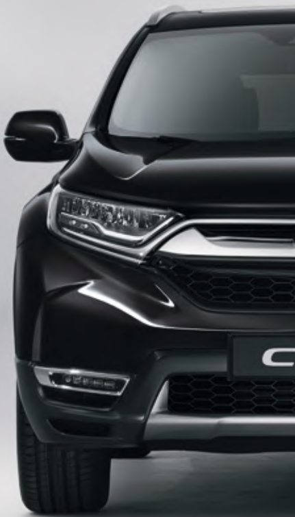
CRYSTAL BLACK PEARL***