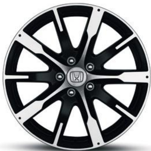
18" CR1801 ALLOY WHEEL

This alloy comes with Gunpowder Black windows and a diamond cut A-surface with shiny clear coat.